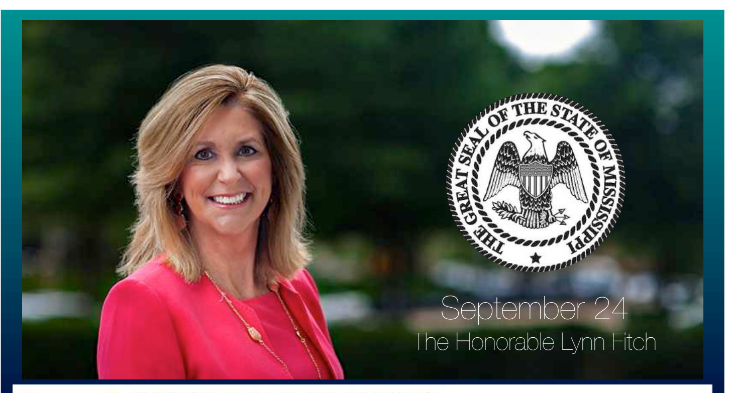
Group Study Exchange - Applications for Team Leader